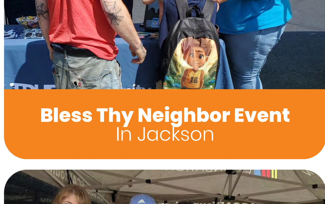
Bless Thy Neighbor Event In Jackson