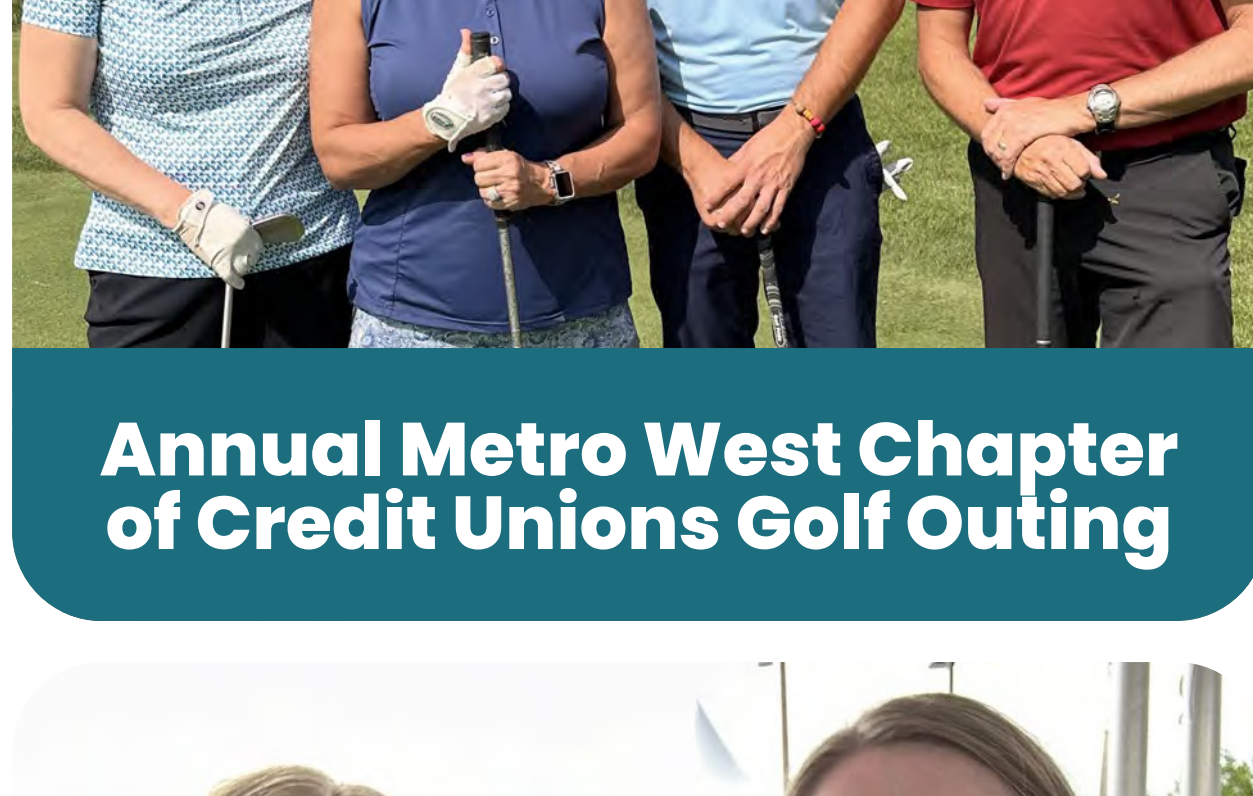
Annual Metro West Chapter of Credit Unions Golf Outing

Proud to give back and support our community!