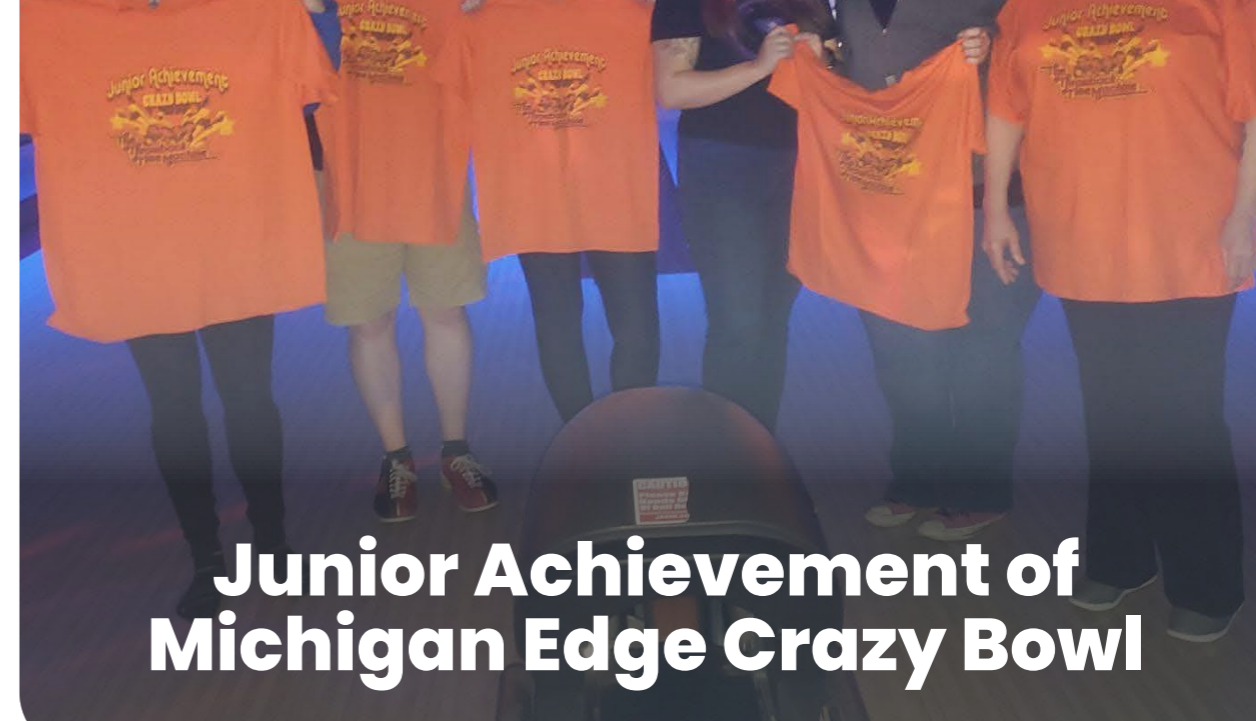
Junior Achievement of Michigan Edge Crazy Bowl