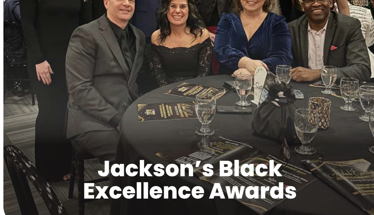
Jackson's Black Excellence Awards

Visit the TRUECCU News and Events page to register.