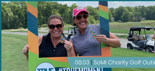
08.03 | SoMi Charity Golf Outing

We can't wait to show off everything our newest branch has to offer, and we're excited to share the experience with you! We'll see you October 18!