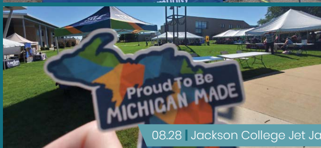
08.28 | Jackson College Jet Jam