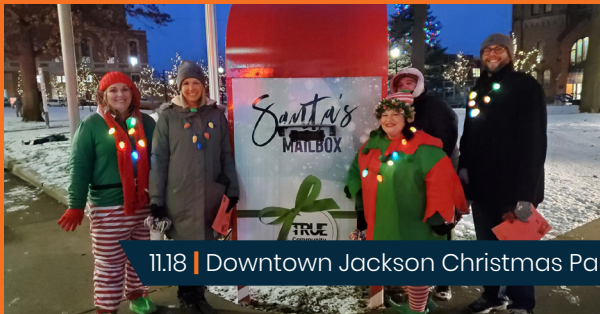
11.18 | Downtown Jackson Christmas Parade