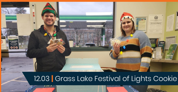
12.03 | Grass Lake Festival of Lights Cookie Tour