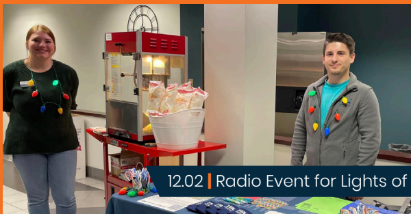
12.02 | Radio Event for Lights of Love